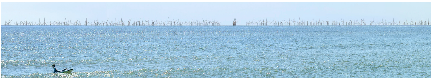
BOEM's simulated view from Cisco beach in Nantucket at a distance of 16.2 miles with 90% humidity.

We are a nonprofit and have filed for 501(c)3 status.